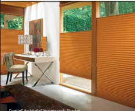
Duette® Architella® Honeycomb Shades

Stop in and see us at the La Crosse Area Builders Association Home Show! See the 2013 colors of the year!